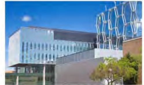
Institute for Quantum Computing and Nanotechnology